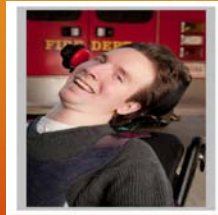
ROB'S RESCUE facilitating special needs emergency transportation and care