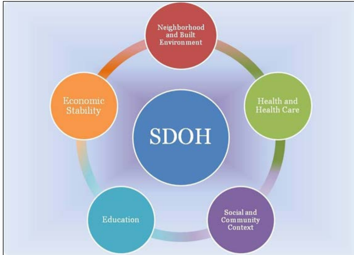
Healthy People 2020 framework model